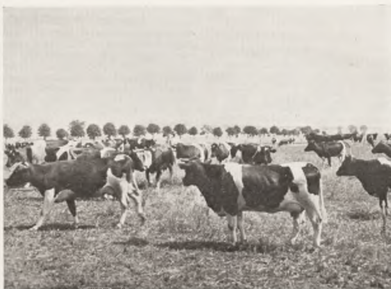
FINE SPECIMENS OF LOWLAND CATTLE

— During the second half of August the prices of butter were distinctly weak. The fall in the value of this commodity is to be attributed to the greater supply and the falling off in the demand from foreign markets. The demand from local consumers was very small as a direct result of the