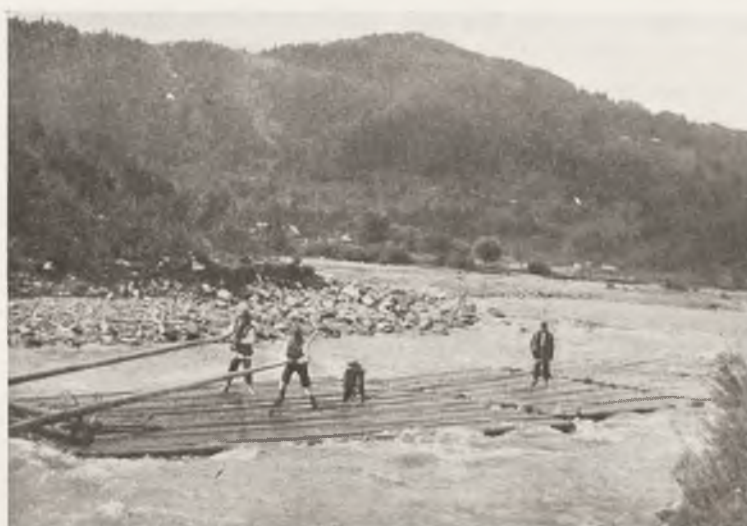
TIMBER RAFTS IN SOUTHERN POLAND

— Concurrently with the opening of the summer slack season in July, prices were maintained and became more stabilised on the timber market although transactions in round-wood fell off in