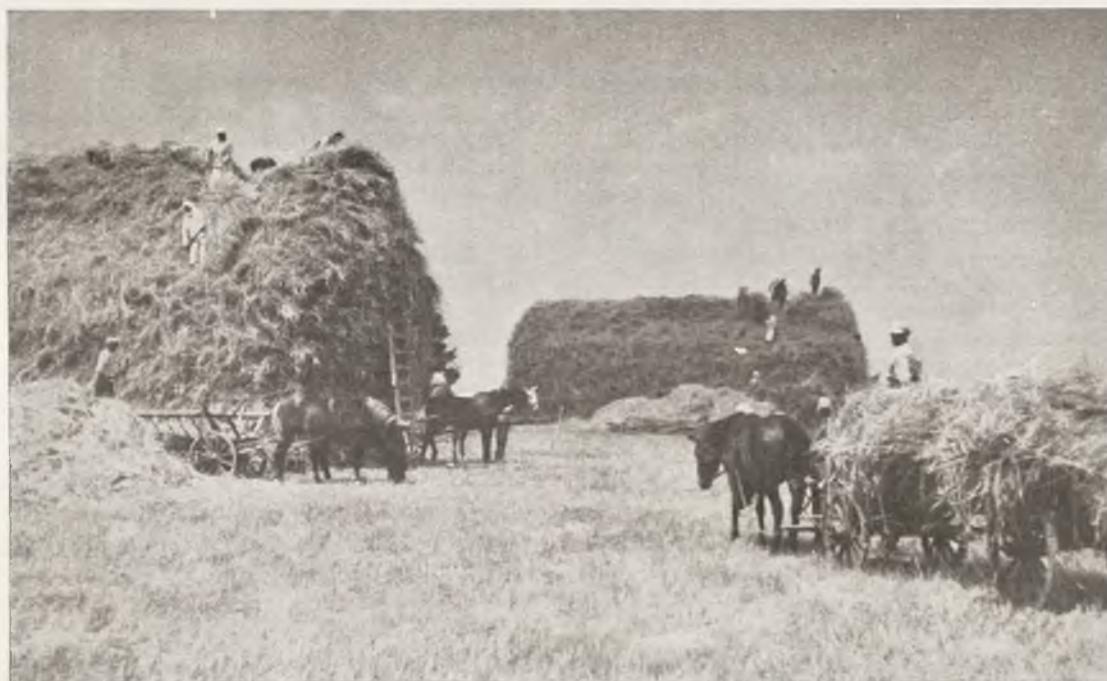
STACKING CORN IN WESTERN POLAND

As regards the English financial crisis, there was never any serious danger of Poland being greatly affected; economic relations have been hardly close enough, whilst the gold exchange standard of the Bank of Poland was only in a most negligible degree based on the pound sterling. There can be no doubt, however, that the perturbations experienced by such a powerful economic unit of world-wide importance as Great Britain, cannot but exercise