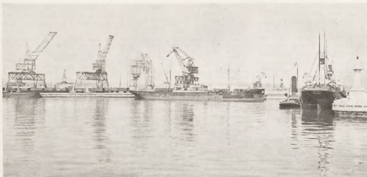
COAL CRANES AT THE PORT OF GDYNIA

During May, June and July this year, record monthly figures of over 1,000,000 tons of coal were loaded at Danzig and Gdynia. This volume could never for technical reasons be handled by Danzig alone and explains why the turnovers of Gdynia are constantly expanding