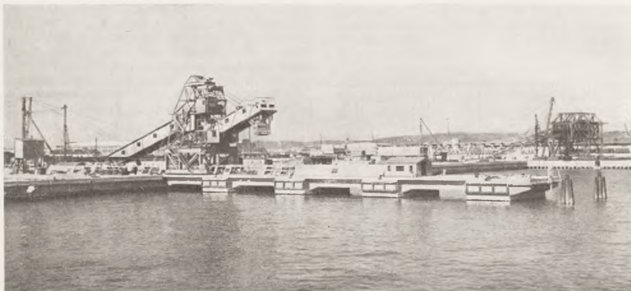
AN UP-TO-DATE BELT CARRIER COAL LOADING CRANE AT GDYNIA

It is an interesting fact that the volume of general cargo handled at Gdynia is steadily increasing both in export as in import. Experience has shown in the past that any larger volume of this trade is difficult of attainment for a new port and usually marks the final stages of its develop-