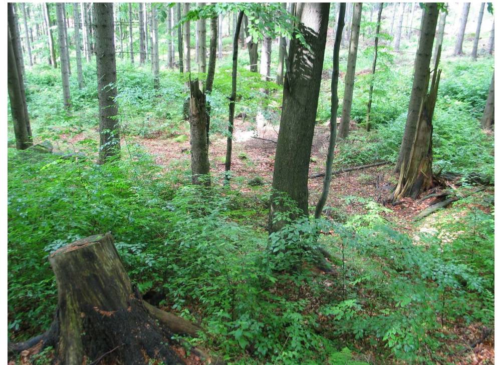
Fig. 1. Beech deadwood in the Karkonosze Mountains

Samples were taken three times during the growing season, i.e. in the spring (April/May), summer (June/July) and fall (October/November) of 2015-2016 in the Karkonosze Mountains and of 2016 in the Tatra Mountains. Research posts in the Karkonosze Mountains in 2015 included three areas of the lower and upper montane of the western districts of the Karkonosze Mountains National Park: Chojnik, Szrenica and Kocioł Szrenicki. In 2016 the posts were located in the foothill areas (Góra Żar and Szerzawa), the lower and upper montane of the Karkonosze Mountains National Park (Petrovka, Wilcza Poreba, Kocioł Łomniczki, Łomniczka Valley) (Table 1, Figure 2). No mycological research of sycamore deadwood was carried out dur-