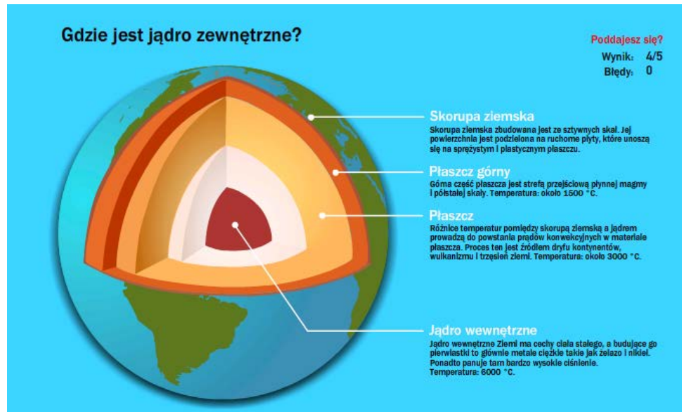
Fig. 4. The Earth game launched at gry-geograficzne.pl