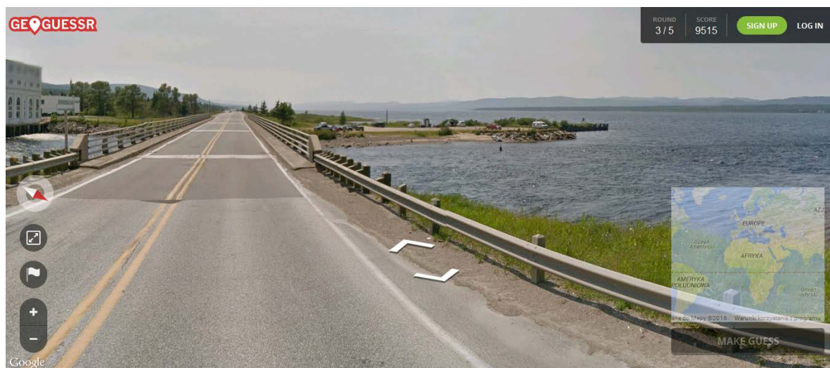
Fig. 1. Geoguessr.com screenshot

The World Geography programme, which needs to be installed, can be downloaded free of charge from the