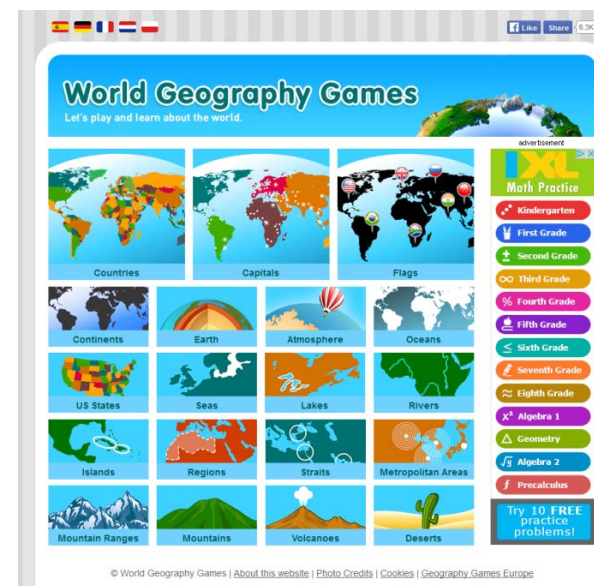
Fig. 3. List of games on the website http://world-geography-games.com (the Polish version is available at gry-geograficzne.pl )

school students to help them in learning the location of specific countries. Lower secondary school students can make use of that part of the game which consists in verification of knowledge through selecting the correct reply option from the list or indication of the right element on a graph or diagram. For instance, the Earth game enables consolidation of knowledge about the geologic layers of Earth (Fig. 4).