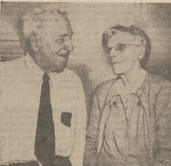
AMOS ALONZO STAGG, 92, who coached football at the University of Chicago for 40 years, 1892-1932, looks vigorous as he poses with his wife before reunion of his "boys" at a banquet of the "Order of the C" in Chicago.