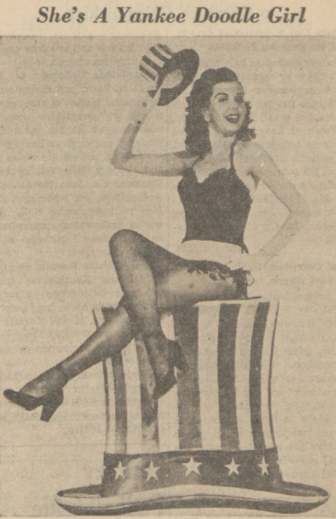
ANN MILLER goes all out when it comes to celebrations, and for her, July Fourth is definitely the biggest. Ann starts filming "Weekend At Las Vegas" at M-G-M shortly.