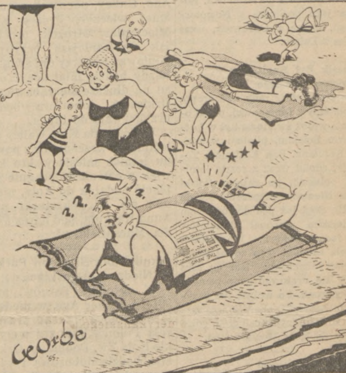
"Don't you remember we left your beach ball at home?"