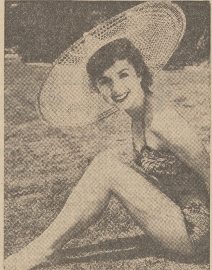
DEBBIE REYNOLDS favors this sunhat of old Mexico which is made of straw and lets the sun's rays sneak through, casting a pretty shadow. Debbie starts filming "The Tender Trap" shortly at M-G-M with Frank Sinatra. The picture is an adaptation of the Broadway stage hit of the same name.