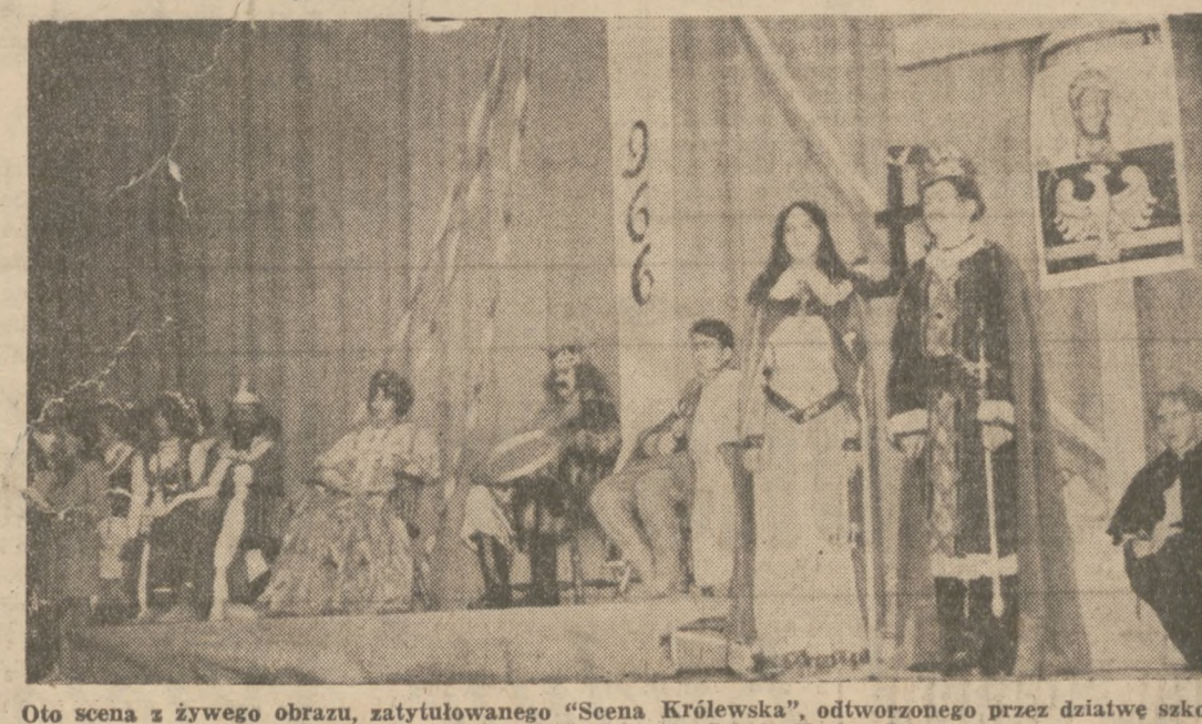
Oto scena z żywego obrazu, zatytułowanego "Scena Królewska", odtworzonego przez działkę szkoły Pułaskiego, w audytorium W. Szkoły Techn. Lane.

Chicago Bulls Open Basketball Season Tonight