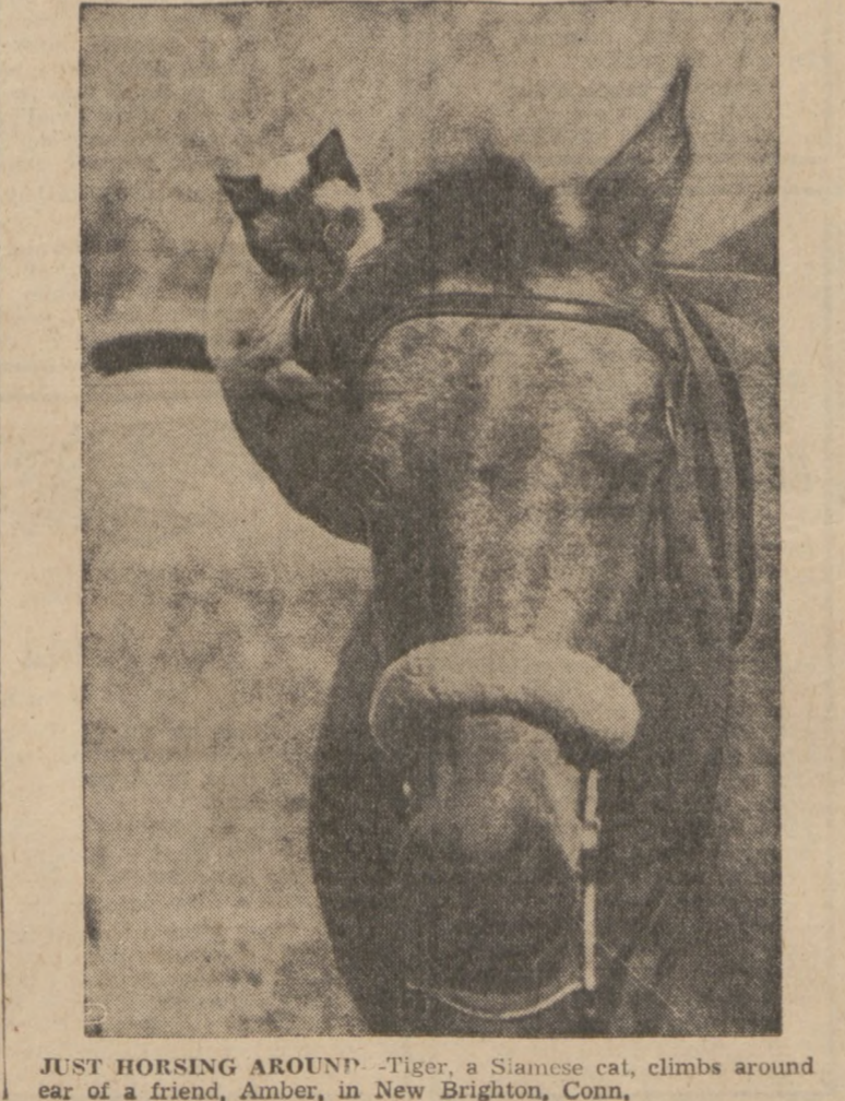
JUST HORSEING AROUND—Tiger, a Siamese cat, climbs around ear of a friend, Amber, in New Brighton, Conn.