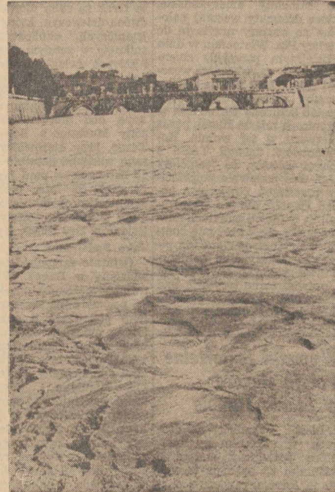
FLOOD ROUTS FAMILIES IN ROME—Italian soldiers and firemen evacuate families as floodwaters from the rain-swollen Tiber River gush through the center of Rome. In the background is the dome of St. Peter's Basilica.