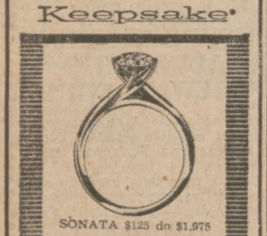
SÓNATA $125 do $1,975