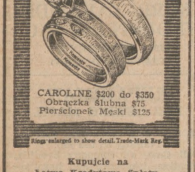
CAROLINE $200 do $350 Obrączka ślubna $75 Pierścionek Męski $125

Kupujcie na Łatwe Kredytowe Spłaty. Mówimy po polsku.