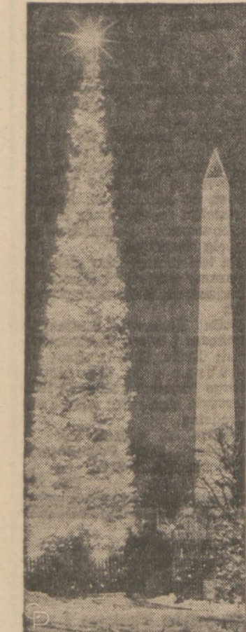
REALLY TALL — The National Christmas Tree appears taller than Washington Monument in this low-level photograph made with the tree lights glowing. The tree is a 65-foot Red Fir from the Sierra Nevada Mountains and is estimated to be at least 80 years old.

Cover the outside of the boat and decorate the sail in a jaunty nautical way with one or more of the fourteen colorful Mystik tapes. Bright primary shades — red, blue, and yellow—often look best. Then stand, aside and call "ship ahoy!"