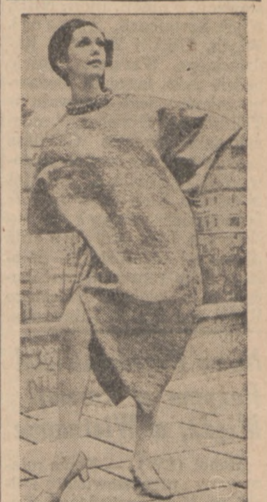
CAPE DRESS—A model wears an orange wool cape-style dress by Riva of Rome as autumn-winter fashions are shown in the Eternal City. The frock features a pointed hemline and slit side.

IN PUTTING MY idea into words, I have to say that security is that element which is sought by all animals in everything they do or say, no matter how minor or inconsequential. This endeavor does not necessarily mean gaining it just for oneself but can be manifest in gaining it for someone else. I add a necessary note of practicability to the theory by saying that if a feeling of insecurity arises, an animal will react in an apparently offensive but actually defensive manner, in an attempt to again feel secure. On this last point an obvious conclusion may be drawn that, to keep an animal contented, don't.