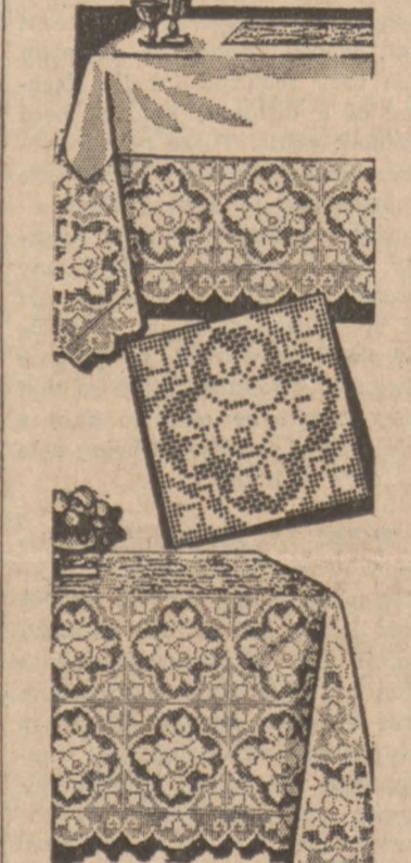
7330 by Alice Brooks