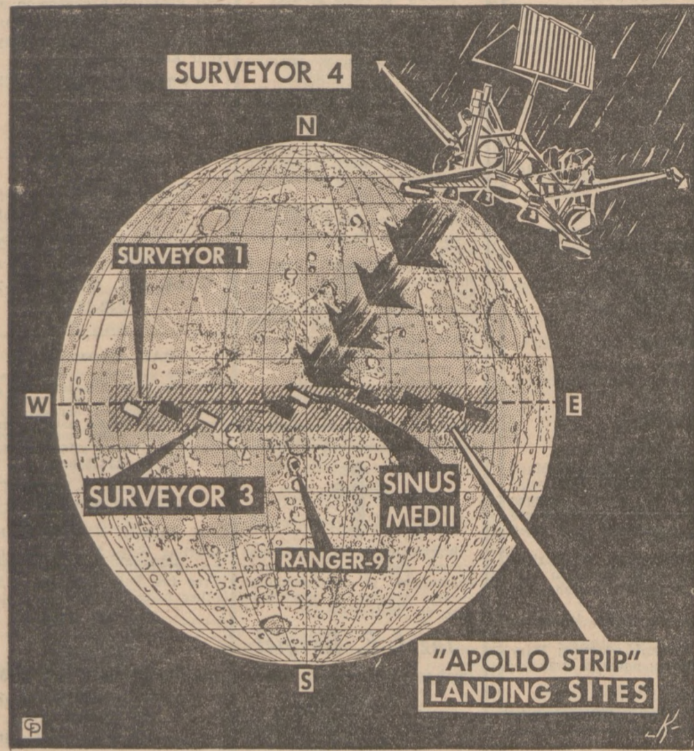
DIAGRAM ILLUSTRATES the Surveyor 4 mission to the Moon—a soft landing in the planned Apollo area to televise pictures of the Moon's surface and samples of its soil.