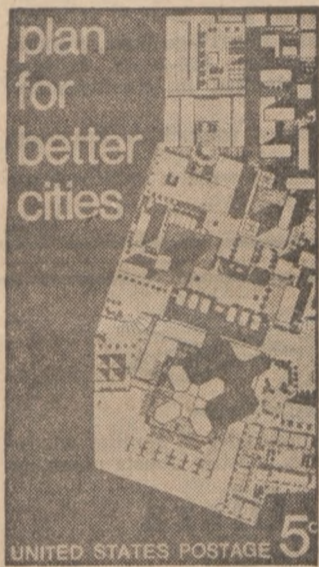
URBAN PLANNING—This is the design of the Urban Planning commemorative stamp to be issued in Washington on Oct. 2 during a "summit meeting" of experts concerned with all phases of city life in the year 2017. It's a bird's eye view of a planned city. City is white, black and light blue and surrounding area is dark blue.