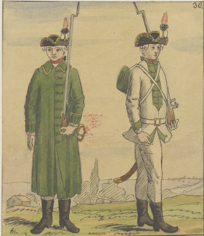
Artillerie Uniform im Mantel in der Weste.