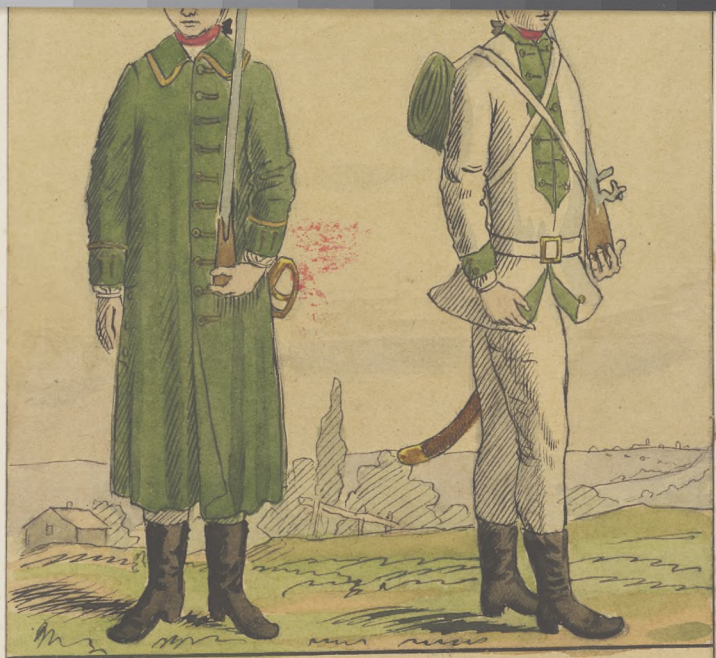
Artillerie Uniform im Mantel in der Weste.

A 1 2 3 4 5 6 M 8 9 10 11 12 13 14 15 B 17 18 19