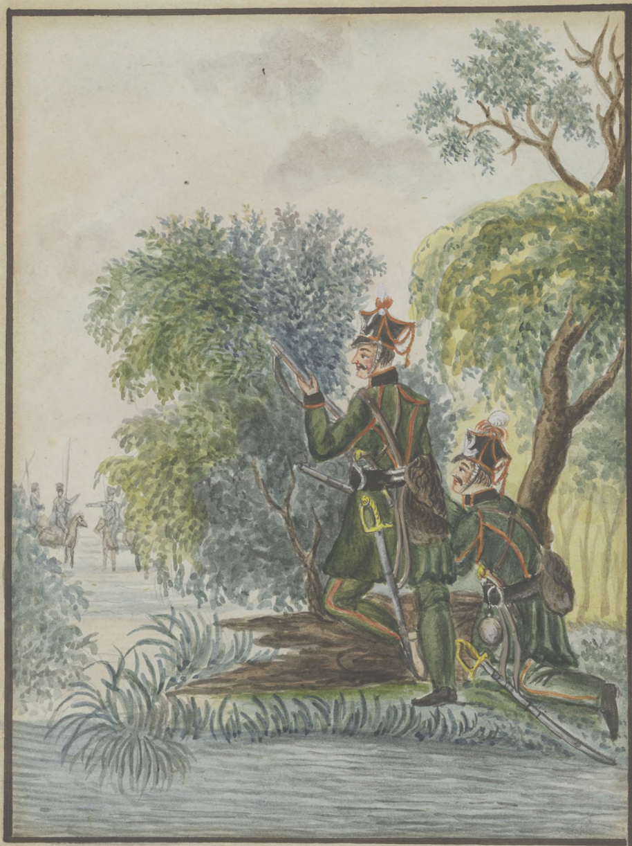
WOLNY STRZELEC PIESZY.