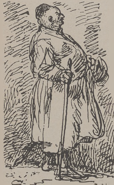
"A Polish Squire" by Jan Piotr Norblin (1777)

DERIVED from the Italian word, caricare , meaning to overload or exaggerate, a caricature in its broad sense is any drawing, painting or sculpture of a satirical or humorous nature. The Poles include under this heading not only caricatures proper, but lampoons, political cartoons, grotesques and mildly satirical line drawings.