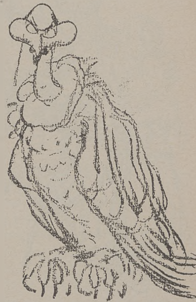
Painter Leon Wyczolkowski, by Fryderyk Pautsch

It was in Kostrzewski's time that the first humorous papers came into being in Poland— The Mirror of Asmodeus in 1856, Free Jokes in 1858, the Fly in 1868, Thorns in 1871. The "humor corner" became a permanent feature of other illustrated publications. In this period of romanticism, caricature in Europe lost its pure humor and acquired a more frankly satirical character—political or social. In enslaved Poland political satire could not circulate freely. Of necessity the emphasis was placed on social satire. Kostrzewski, more or less imitated by a whole generation, stands out as a professional cartoonist in this period. From 1860 to 1880 he filled the illustrated papers of Poland with his humorous drawings. These drawings, aside from their