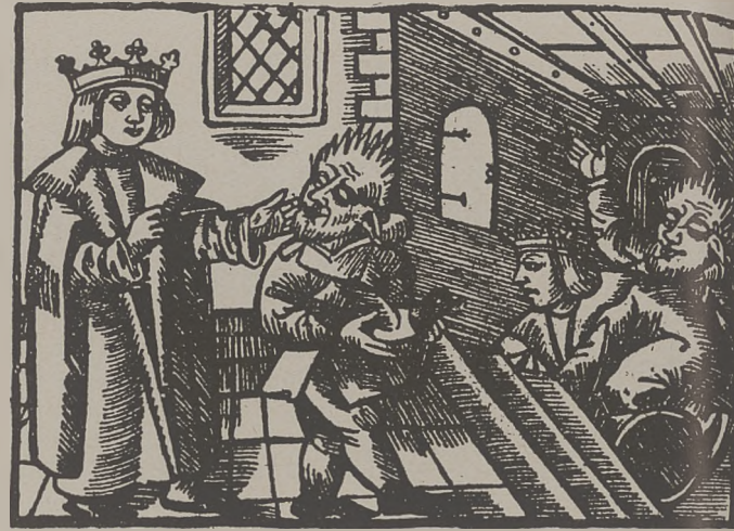
Early Polish Caricature (16th Century)

of medieval art appear ambulant troupes of trained animals clad in contemporary raiment and performing humanlike acts for the edification of the crowd.