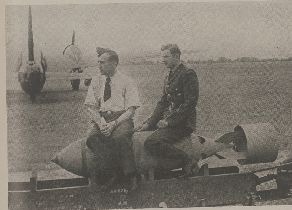
TWO POLES ON A BOMB

Chopin's Prelude, a fireplace, and real rain on the window pane made a close harmony. Suddenly it became warmer and more cheerful in the Polish airfield.