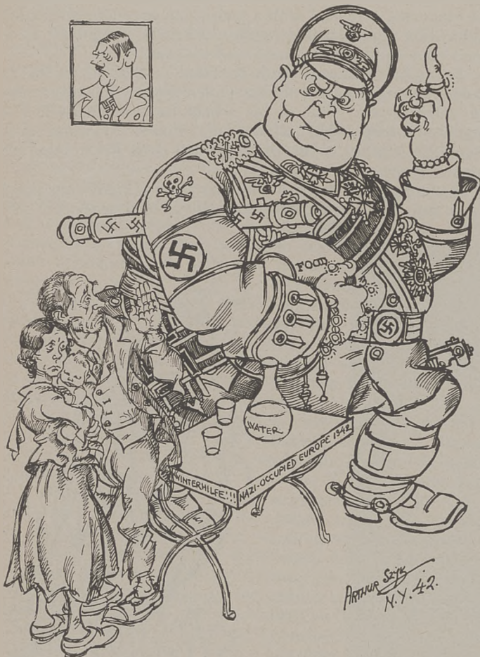
"Good news, Germans! Water won't be rationed!" by Arthur Szyk (1942)