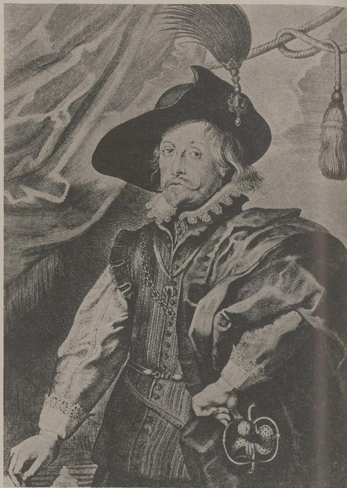
KING WLADYSLAW IV, BUILDER OF THE POLISH NAVY Engraving by Paulus Pontius (1624) after a portrait by P. P. Rubens