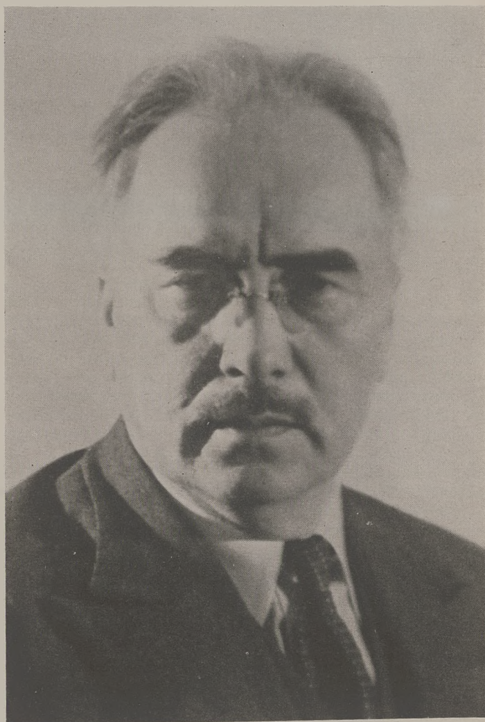
Prof. STANISLAW KOT, Minister of Information of the Republic of Poland

Already during two weeks of heavy bombardment Warsaw had lost many of its libraries, museums and other treasures. But it must be said that the systematic plundering carried on after hostilities were concluded brought far worse losses on the Polish nation. The Board of Education is occupied by the Gestapo, the University by the Security Police, the