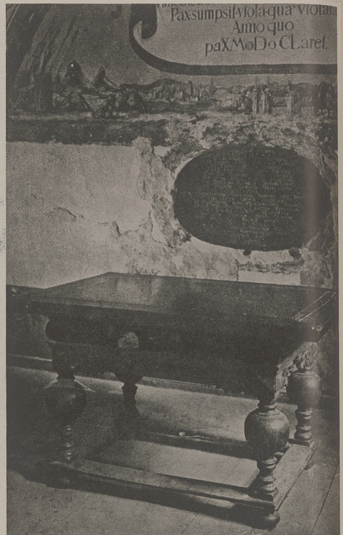
The table in the monastery of Oliva used for the signature of peace between Poland and Sweden in 1660.

There were sporadic attempts in the following centuries to create a new Polish navy, but unfavorable circumstances prevented the realization of these hopes. It was not until 1918 that reborn Poland could finally realize its age-old dreams. In the twenty years of her existence Independent Poland fully appreciated the importance of a fleet and a merchant marine. No effort was spared to make the nation sea-conscious. The results are evident enough. Today, after four years of cruel warfare, the Polish Navy is greater and more powerful than when the war started, and has won the highest praise from the British Royal Navy for its many deeds of heroism in the Battle of the Atlantic and on the Seven Seas.