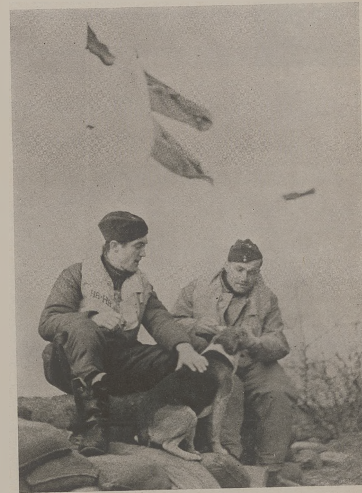
GOOD TO SEE YOU, OLD PAL

Sure now that help was coming, we shivered and fought with the waves. Two hours later a rescue plane, the so-called "Walrus," began to circle above us. He could not come down because the water was too rough. He circled around several