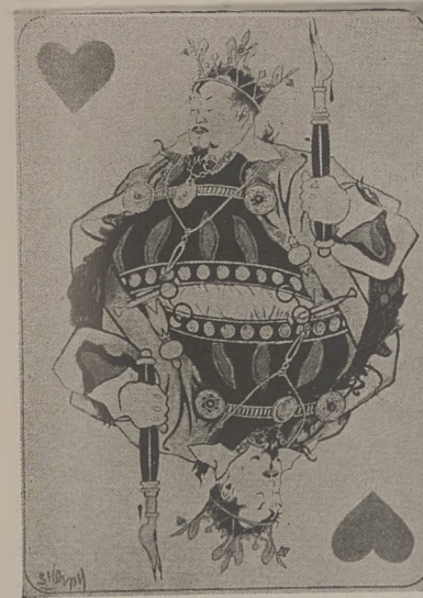
Poet Kasprowicz as King of Hearts (1915) by Kazimierz Sichulski

of pupils, disciples and drinking cronies to him, and founded the first "school" of caricature in Poland. Gifted with unusual verve, a fine sense of the comic and a satirical bent, he specialized in depicting the humor of Polish life before the partitions. Orłowski's gentry were anachronistic to be sure. Yet they were Polish par excellence, and could still be found on country estates far from all beaten tracks. The artist's temperament and amiable character made him very popular among his amateur and semi-amateur disciples, and he was imitated by countless other Polish caricaturists, who knew him only from his published works.