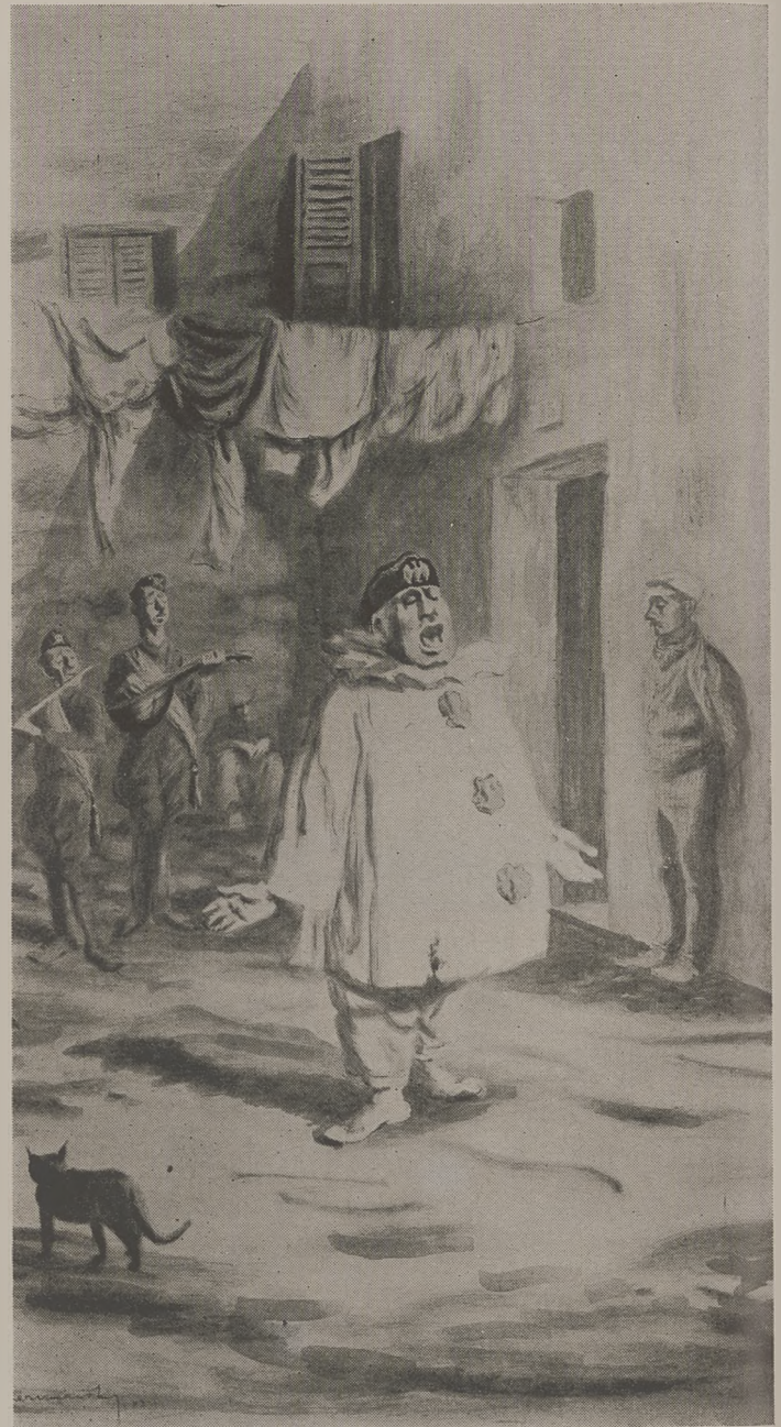
"Laugh, Clown, Laugh!" by Zdzisław Czeremski (1943)

Around 1870 the heroic period of European caricature drew to a close. Naturalistic accuracy, characterizing the period, excluded exaggeration, grotesqueness and stylization, the inseparable elements of this art. Deserving of attention