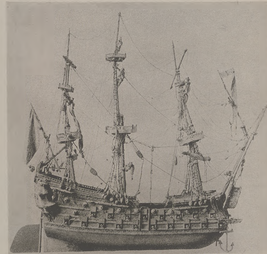
A 16TH CENTURY POLISH MAN O' WAR