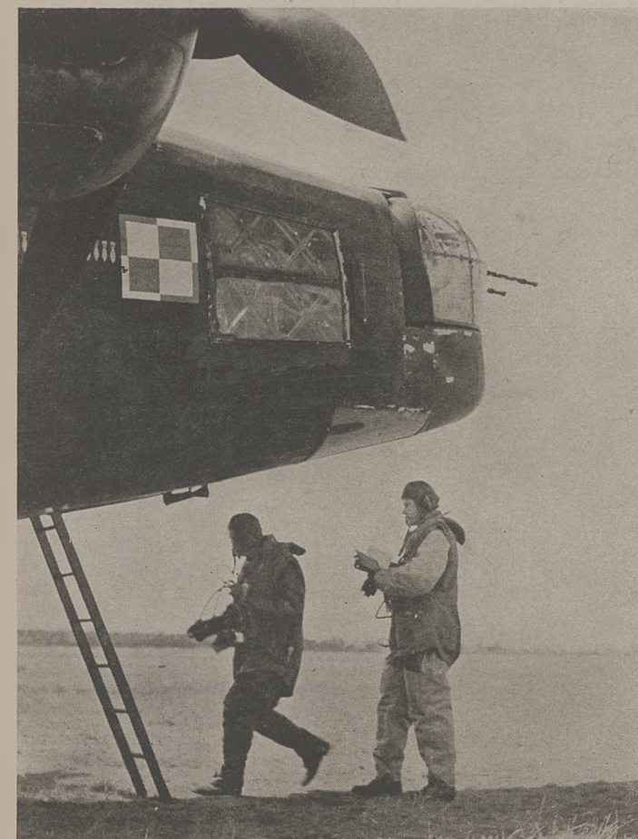
POLISH BOMBER ABOUT TO TAKE OFF