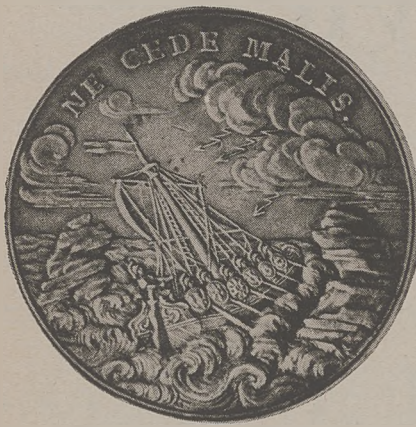
"DO NOT GIVE WAY TO EVIL" Polish medal struck in 1768

THE Polish Navy, sailing the seven seas, contributing its quota to the winning of the war by lively sea-battles and dreary convoy duty, is a young navy, one of the youngest among the United Nations.