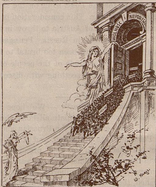
When will She enter the Temple of Freedom?

This cartoon appeared in the Polish Daily News (Dziennik Chicagowski) shortly after the introduction in the British Parliament of the Irish Home-Rule Bill.