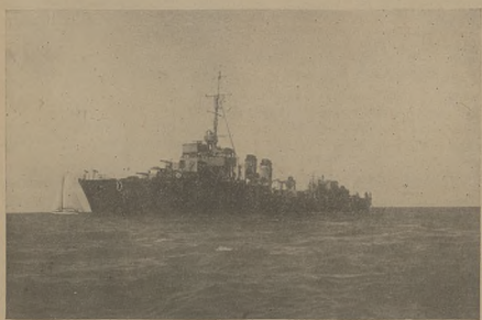
A Polish T. B. D. off the Baltic Coast