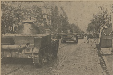
Marshal Smigły Rydz taking the salute