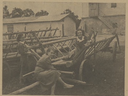
A happy group of farm girls