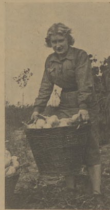
Something for dinner

After the religious ceremony we went to visit the exhibition of the produce and work of all the camps. The agricultural centres provided vegetables of their best. A gigantic still life, a carpet woven of beetroots, carrots, cabbages and onions, was very cleverly arranged at the entrance of the shed in which the best kind of sowing grain, prize poultry