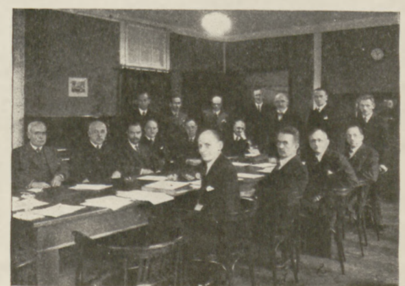
Polish YMCA National Council in session in the Krakow YMCA building.

Students of Polish-German relations will find a large store of rich material in a new book called „The German Paradox“ by A. Plutynski, published by Wishart and Co., 10 John Street, London, W. C. 2. Its 228 pages of ably written material on the agricultural, industrial, political and general economic situation in East Prussia throw much light on the conditions in this eastern colony of Germany in the middle of the Slav world. As the materials upon which the book is based are drawn from German sources its conclusion have the larger interest. These conclusions, much too important to be compressed into a notice of this kind, make the book one of the most significant of the year in the field of European political relations.