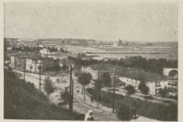
The water-front at Gdynia.

The new YMCA at Gdynia goes steadily forward. Polish interest in this new city and everything related to it is extraordinary. It is sometimes referred to as Poland's "Window on the Sea" but it is vastly more. It is the open end of the Corridor, the door through which must flow Poland's economic connections with the rest of the world. It is Poland's Boston, New York,