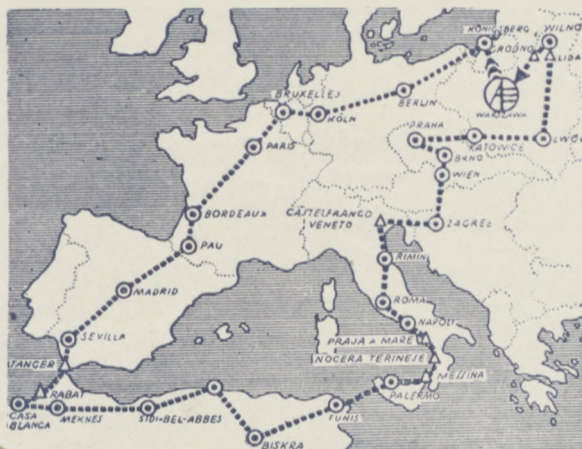
The route of the race.

For the second year in succession the Krakow YMCA has won the national basketball championship, working its way to the final victory against a number of strong teams from every part of Poland. As our champion players are our own home-grown products we take great satisfaction in this championship.