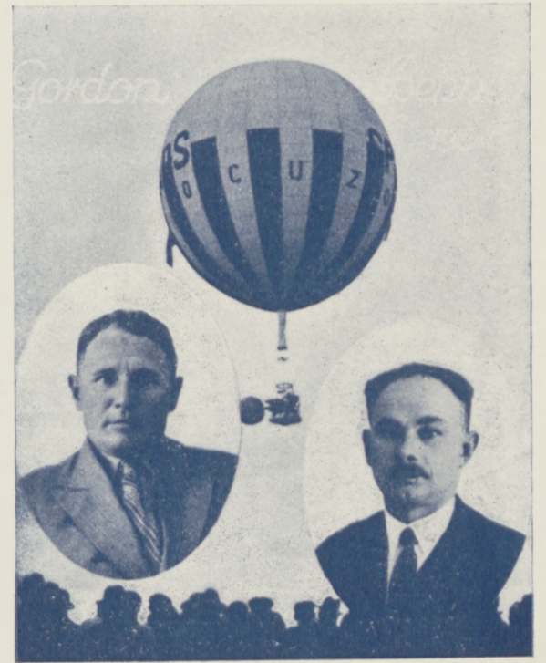
The winners and their balloon, the "Kościuszko".

Poland came in first and second in this exciting bi-annual 6000 mile air-plane race over Europe and North Africa.