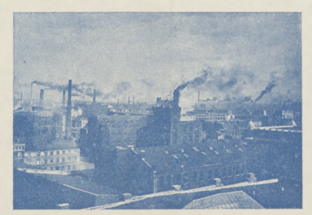
Lodz, the Manchester of Poland.

THIS NUMBER IS DEVOTED TO LODZ, "THE CITY OF A THOUSAND SMOKE STACKS"