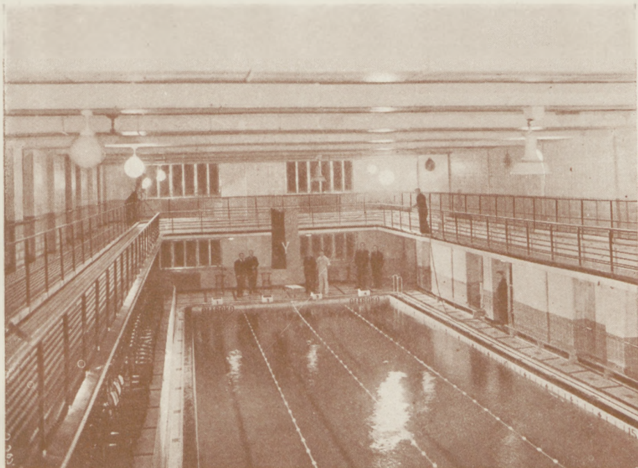
Warsaw YMCA Pool just before the official opening.

Having found a slightly cheaper method of mailing, we will now add new names to our mailing list at 50 cents or 2/- each. Send no metal coin and do not bother with money orders. Send only American or British postage stamps. We will manage to cash them. You that are already on the list, just stay put.