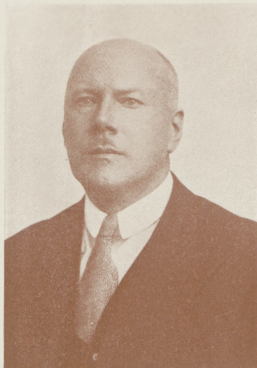
Mr. Władysław Jaszczolt, Minister of Social Welfare.