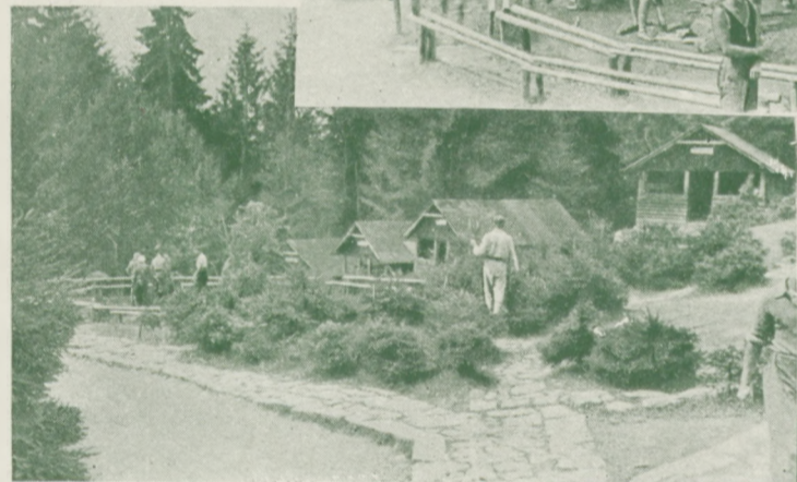
View of one side of the Camp