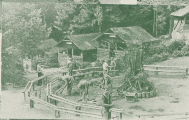
Three of the 15 Cabins and the Council Ring