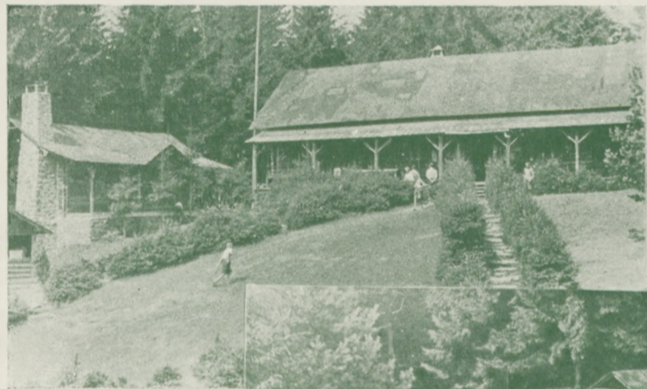
Guest House "Aloha" and The Lodge

In the middle of the summer 28 young men in Wilno sent a letter to the national headquarters of the Polish YMCA asking for the organization of a YMCA in their city. Two representatives of the National Council visited Wilno soon after receiving this letter and decided that by all means the request of these young men should be complied with. A committee of organization was immediately formed and at this writing over 100 members have added their names to the roll. Wilno is a city of 210,000 population, located in the north-east part of Poland. It is a beautiful city, dear to all Poles because of its intrinsic beauty and the part it has played in Polish history, and now doubly important in the estimation of Poles because there now lies buried the heart of Poland's great leader Marshal Pilsudski.