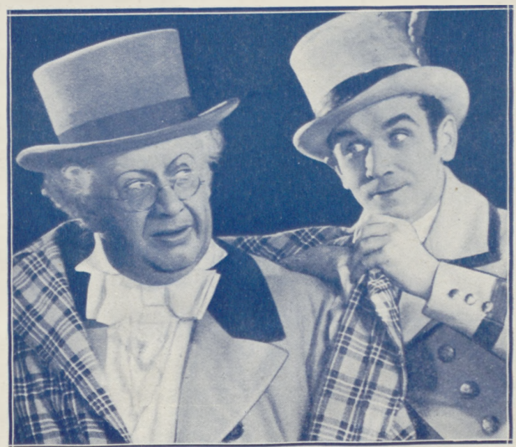
Pickwick and Sam Weller