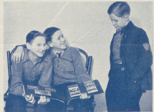
3 of the 649 Boy Members.