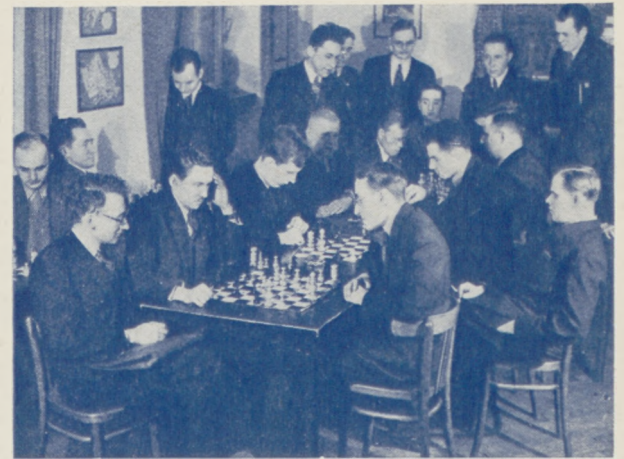
Y Chess Club, Warsaw Champions