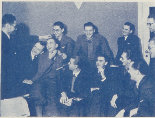
Where good fellows get together