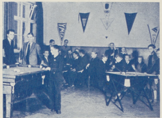
The Boys' Game Room.