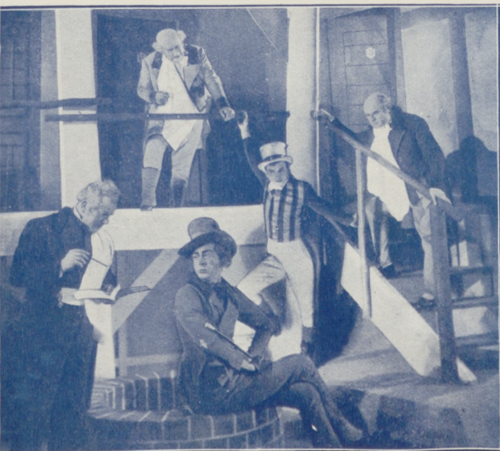
Squaring accounts with Jingle.

It is the big event of the dramatic season in a city famous for the excellence of its stage. The theatre is sold out night after night and the play, full of delicious fun, will have a long run.