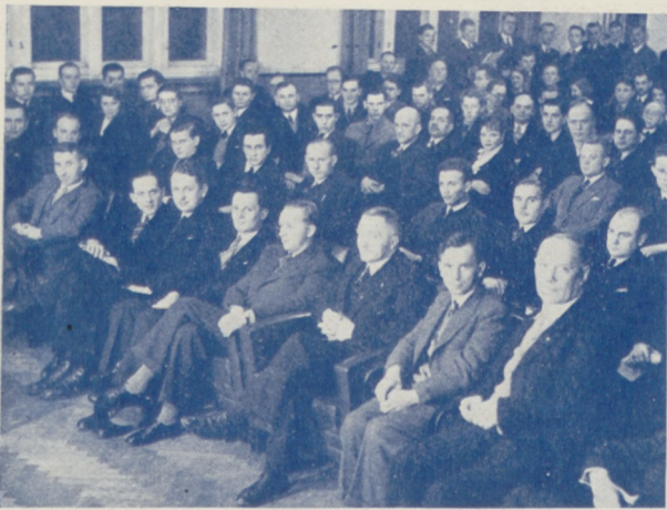
A Members' Forum.