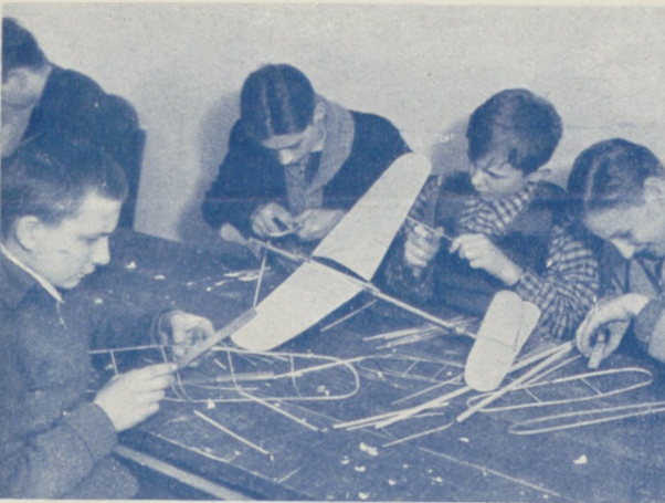
Making Glider Models.