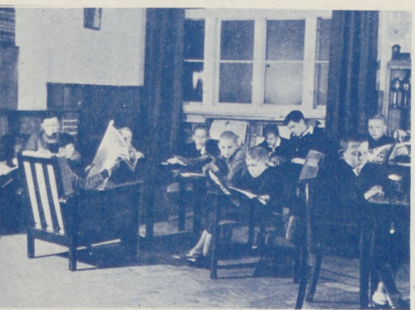
The Boys' Reading Room.