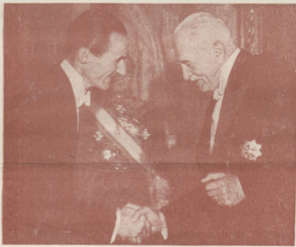
Mr. Anthony J. Drexel Biddle, new Ambassador of the United States to Poland, presenting his credentials to Dr. Ignacy Moscicki, President of the Republic.

to be done only the large auditorium, for which purpose funds are now being sought, some $25,000 being needed. It would be a splendid memorial hall, with the exception of Parliament the only large auditorium in its section of the city. There is no debt on the building and the $900,000 plant will be completed free of encumbrance.