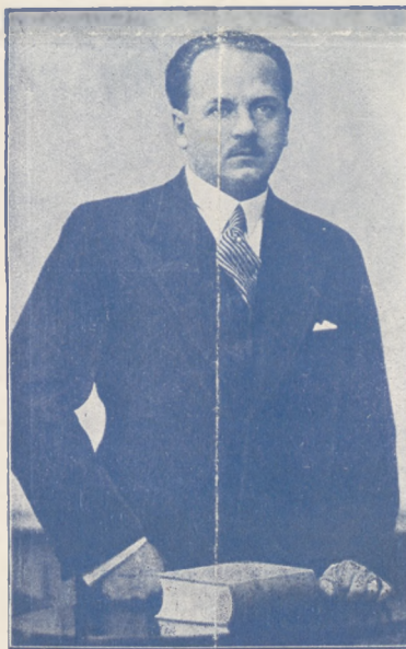
Minister Marian Zyndram-Koscialkowski Former Premier, now Minister of Social Welfare

In common with other countries, Poland has a serious problem of unemployment. An important factor in its solution is a large government agency created under the leadership of Minister Zyndram-Koscialkowski bearing the name "Pomoc Zimowa" or "Winter Help". It relates the unemployed to construction, building, and industrial enterprises during the five months of the winter, paying them for their work from funds secured by special taxes and contributions.