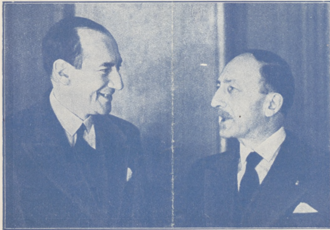
The Polish and French Ministers of Foreign Affairs Colonel Jozef Beck M. Yvon Delbos

The permanence of Poland's defensive alliance with France was strongly emphasized during the recent visit of the French Minister of Foreign Affairs, M. Delbos, to Poland. Both the "Manchester Guardian" and Minister Eden's "Yorkshire Post" have recently paid tribute to Poland's useful function in preserving peace in Europe. Poland's success in this matter is due in no small degree to the quiet, smiling, but strong and competent work of Minister Beck.