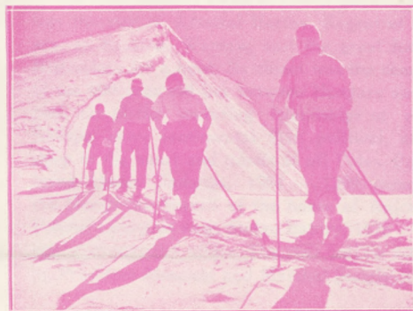
Bright sunshine, high mountains, good snow