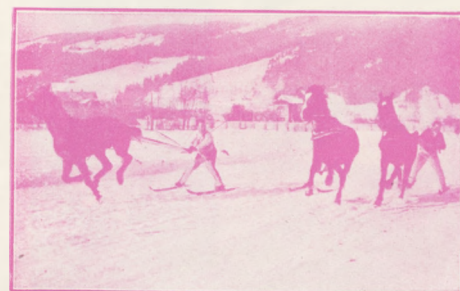
Winter sport at Zakopane