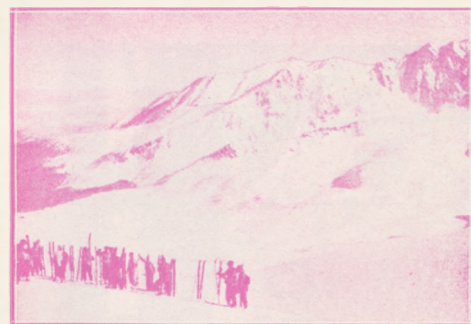
Where the aerial railway lands them

Maybe this will catch the eye of someone who can help make up this loss with a gift of from $5000 to $50,000.