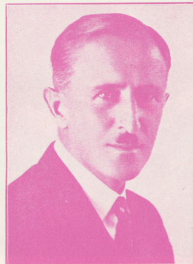
Vice-Minister of Communications Aleksander Bobkowski chief promoter of skiing in Poland and responsible for much of its present great extension and popularity.

The Polish Railway service takes high rank among the railways of Europe. The very devastation of the war required extensive rebuilding of roads, bridges, and equipment, and the result is a service excellent in its accommodations and punctuality. Locomotives, passenger cars and freight cars, are all manufactured in Poland, and these of a quality which has made Polish locomotives an item of export. The new type locomotive shown at the Paris Exhibition was one of the feature exhibits. Electrification of the Warsaw Railway District and Diesel motors for fast trains are among recent improvements.