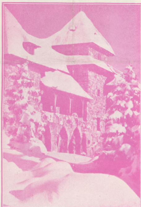
A mountain inn popular with Polish skiers

The Polish boxing team defeated the Italian team, 8 men each, 11 to 5.