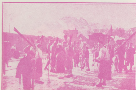
Skiers arriving at Zakopane