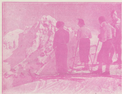
Long views, moderate temperature, good companions