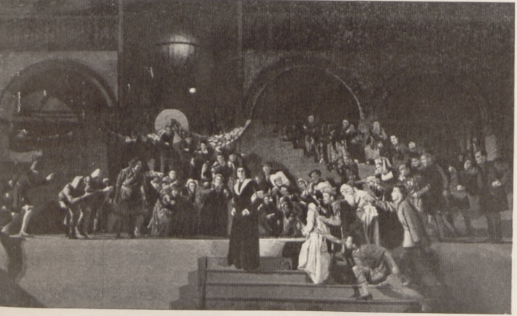
Upper picture: Spectacular performance of "Copernicus" in the courtyard of the old royal castle on Wawel Hill. Copernicus, a Pole, studied in Krakow.

Wit Stwosz's world famous carved altarpiece. THE KRAKOW PAGEANT Each year the ancient royal city of Krakow is the scene of a splendid series of events grouped together as a wast pageant of historical, dramatic, artistic, musical, and religious celebrations. This year the dates are June 4 to 23, and thus begin with Whitsuntide, include Corpus Christi, June 16, and conclude with the traditional street festival called "Lajkonik", in memory of the repelling of a Tartar invasion of the 13th century. Beautiful old Krakow, with its river, castle hill, cloth-hall square, mediseval city walls and towers, lends itself gloriously to such pageants. Historic events are reproduced in their actual setting and in the dress of the middle ages. Picturesque peasant coslumes are unpacked and worn on the streets of the city. The great Corpus Christi procession, most impressive religious celebration of the year, winds its slow way between buildings that were already old when Columbus discovered America and are now part of a bright and pleasant modern city. We're going: we wish we could meet you there It will be over when you read this but it will come again next year. Let's go!