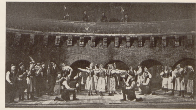
Upper picture: Dance in the Barbican, mediaeval fortification, in the peasant costume of the Krakow district. Lower picture: Modern Krakow. Park replacing the old moat. The globe on the tower at the left is in remembrance of Copernicus.