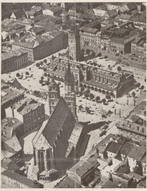
Main square of Krakow, 16th century Cloth Hall, 13th century St. Mary's Church, tower of the mediaeval City Hall, and rear center, Krakow University, founded 1364.