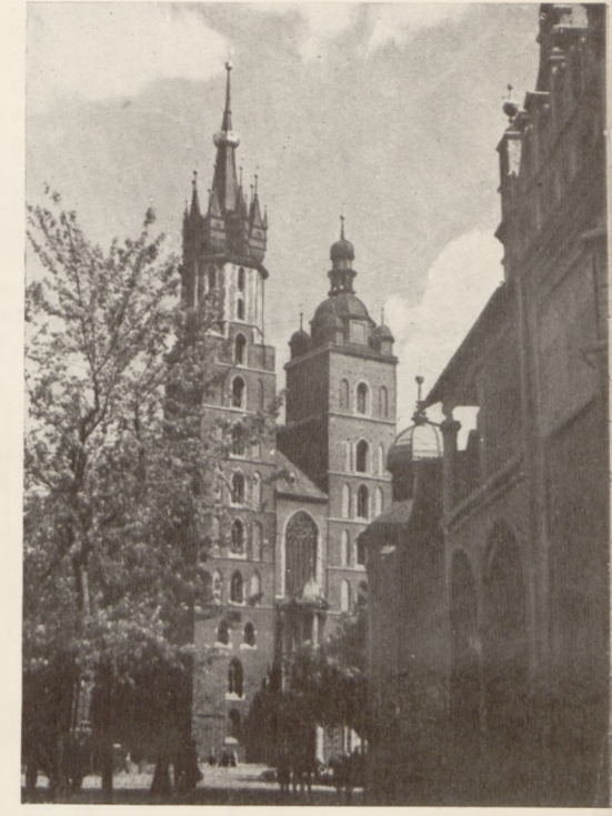
Church of St. Mary, masterpiece of brick gothic ar-chitecture, begun early in the 13th century. In it is Wit Stwosz's world famous carved altarpiece.

Wit Stwosz's world famous carved altarpiece. THE KRAKOW PAGEANT Each year the ancient royal city of Krakow is the scene of a splendid series of events grouped together as a wast pageant of historical, dramatic, artistic, musical, and religious celebrations. This year the dates are June 4 to 23, and thus begin with Whitsuntide, include Corpus Christi, June 16, and conclude with the traditional street festival called "Lajkonik", in memory of the repelling of a Tartar invasion of the 13th century. Beautiful old Krakow, with its river, castle hill, cloth-hall square, mediseval city walls and towers, lends itself gloriously to such pageants. Historic events are reproduced in their actual setting and in the dress of the middle ages. Picturesque peasant coslumes are unpacked and worn on the streets of the city. The great Corpus Christi procession, most impressive religious celebration of the year, winds its slow way between buildings that were already old when Columbus discovered America and are now part of a bright and pleasant modern city. We're going: we wish we could meet you there It will be over when you read this but it will come again next year. Let's go!