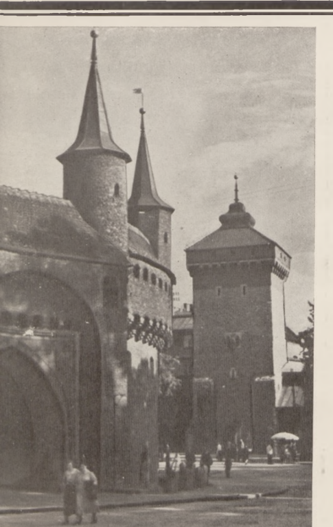
The Barbican and Florian Gate, parts of the old gothic city wall and fortifications.