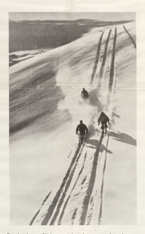
Starting home. High mountains, deep snow, late afternoon sun, twilight clouds.