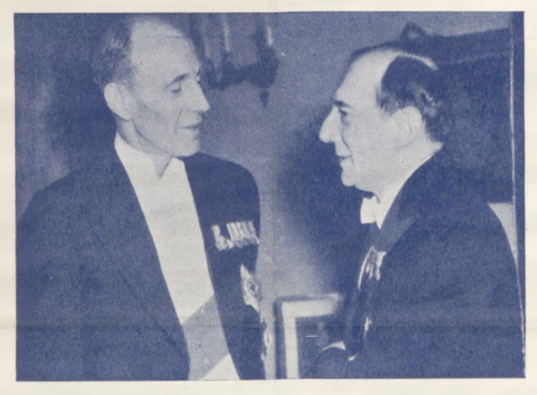
Lord Halifax and Colonel Beck. Foreign Ministers of Great Britain and of Poland.