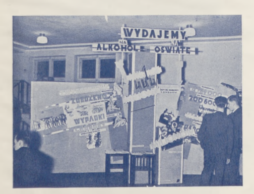
Anti-alcoholic exhibition in the Warsaw YMCA main lobby; showing the comparative results of money spent for alcohol and for education.