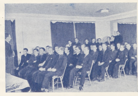
Training class for leaders

The pictures in this column represent the work of the Warsaw YMCA's Old Town Branch, a department conducted for the less privileged boys living in the center of the city. There are 916 of them, led by a strong committee and employed staff of three men.