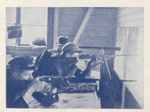
Old Town Branch boys in the semi-annual shooting contest.