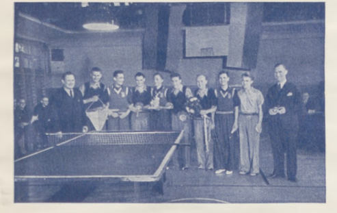
The Lithuanian Table-Tennis Team in the Warsaw YMCA.

April 15th a table-tennis team arrived from Kowno, the Lithuanian capital, to play against a Warsaw team. It was the first Polish-Lithuanian athletic contest ever held and so was an historic occasion. The Lithuanians defeated the Poles 7 to 2 in a splendidly played match.